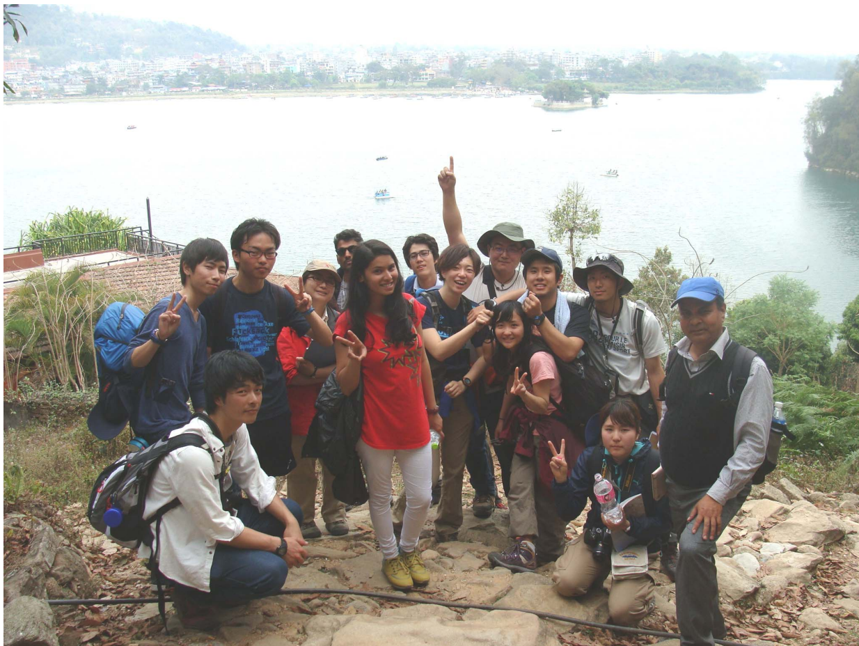
The 5 th Student Himalayan Exercise Tour team at the World Peace Pagoda in Pokhara